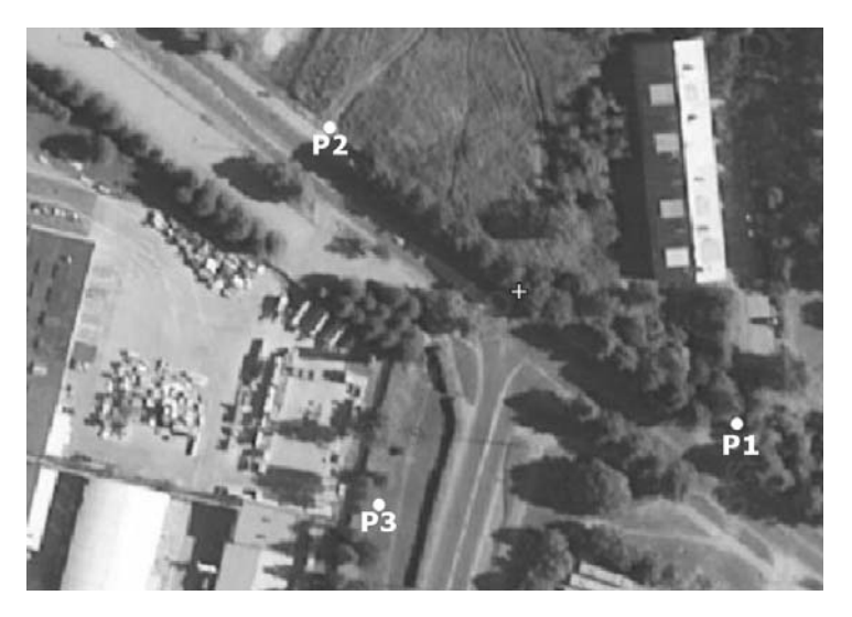
Fig. 2. Approximate map of the analysed area B.

The acoustic climate of the analysed section is shaped by typical car traffic on a city bypass. The measurements were conducted in three controlling points: P1, closest and mostly exposed to noise from multiple dwellings; and P2 and P3 in open areas not protected acoustically. On the analysed section of road the traffic intensity was on average