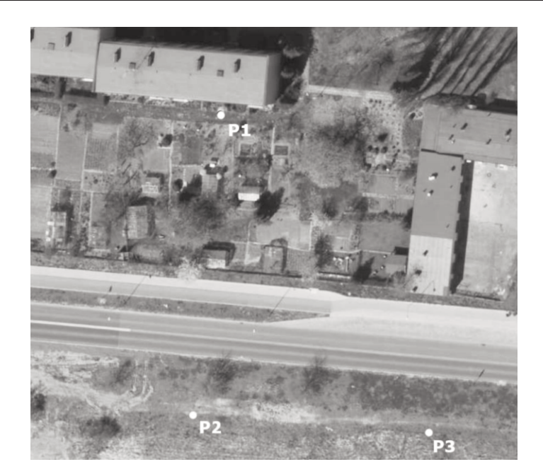
Fig. 3. Approximate map of the analysed area C.

900 vehicles per hour with 8% heavy vehicles. Field measurements were done during the day from 13.30 to 15.00. The results of measurements L_{zm,i} and noise calculations L_{obl,i} in the controlling points are shown in Table 5.